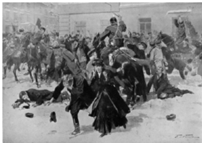
Baku Oil Workers Strike

In December 1904, there was a huge, well-organized strike in Baku, led by a Bolshevik Committee. The strike was victorious and the resulting collective agreement concluded between the oilfield workers and the owners