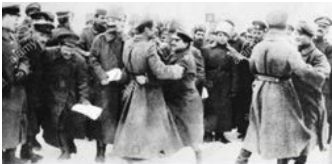
Fraternization of Russian and German soldiers-1917

In essence, the Social-Democrats promoted class peace with their own bourgeoisie and warfare against their working class brothers and sisters. The Bolsheviks, by contrast, advanced the policy of “the defeat of one’s own government in the imperialist war” and they promoted the slogan “converting the imperialist war into a civil war.” In opposition to the petty-bourgeois, social-democrat opportunists the Bolsheviks promoted peace among the workers and peasant toilers of the world and a united working class war against the imperialists, and their monarchist allies. They promoted fraternization of front-line troops on the battlefield from opposing sides, an increasingly frequent occurrence which greatly scared the bourgeoisie.