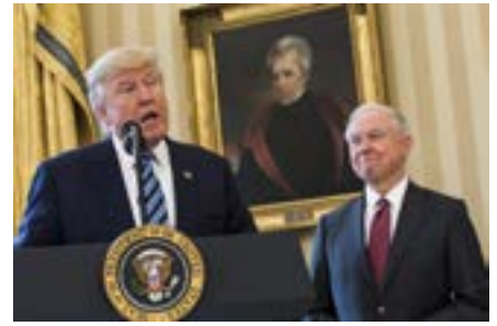
Attorney General Sessions & Pres. Trump

he persists in making very public and sustained criticisms of the openly white supremacist Attorney General he himself appointed to head the Justice