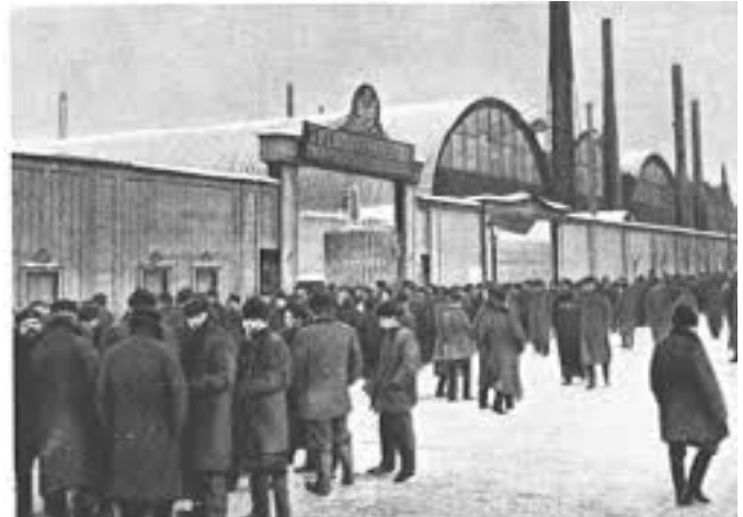
Workers on Strike at Putilov Works

dissatisfaction of the Russian masses, exacerbated by the war, was threatening to re-establish on an even more acute basis the revolutionary situation that had been interrupted by the First Imperialist World War. The most overwhelming mass demand was for peace , that is, for Russian withdrawal from the imperialist war.