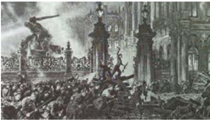
Storming of the Winter Palace

On that night the revolutionary workers, soldiers and sailors took the Tsar's Winter Palace by storm and arrested the Provisional Government. The armed uprising in Petrograd had won. At ten p.m. that very night the Second All-Russian Congress of Soviets opened in the Smolny after the power had already passed.