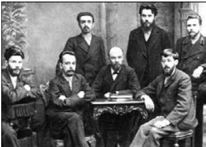
Leaders of St. Petersburg League of Struggle

idea that workers were only capable of fighting for their immediate economic demands and certainly not capable of leading the peasant masses in a successful political struggle for the overthrow of the powerful tsarist state.