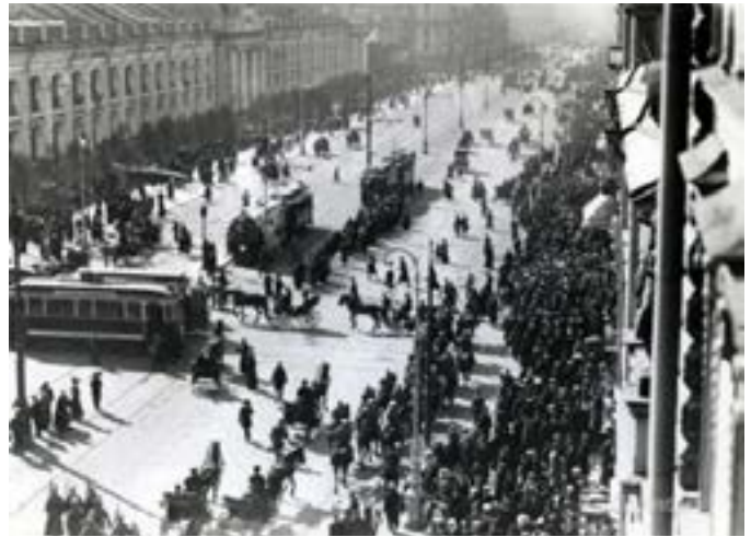
St. Petersburg Demonstration Against the Lena Massacre

The real rise in the revolutionary movement began in April and May 1912 when mass political strikes broke out in connection with the shooting down of workers in the Lena goldfields in Siberia. Of the six thousand striking Lena miners, over 500 workers were killed or wounded upon the orders of a tsarist officer of the gendarmerie. This new bloody deed of the tsarist autocracy in service to the British capitalist masters of the Lena goldfields was committed to break an economic strike of the miners. The shooting down of the unarmed Lena miners attempting to peacefully negotiate with company management stirred the whole country.