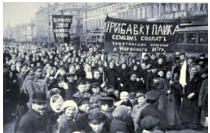
Petrograd Women Workers, International Women’s Day, 1917

On February 18, 1917 (old calendar), a strike broke out at the Putilov Works in Petrograd. Four days later, the workers at most large factories were on strike. The next day, International Women’s Day, at the call of the Bolshevik City Committee, working women came out in the streets to demonstrate against starvation, war and tsardom, backed by a city-wide strike movement. By February 25 the whole of working-class Petrograd (St. Petersburg) had joined the revolutionary movement. The political strikes in the districts merged into a general city-wide political strike. By the next morning the political strike and demonstration began to assume the character of an uprising. The workers disarmed police and armed themselves.