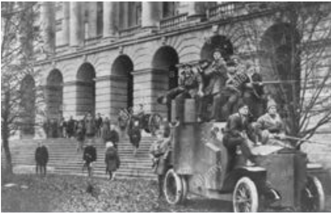
Red Guards in Front of Smolny

On that night the revolutionary workers, soldiers and sailors took the Tsar's Winter Palace by storm and arrested the Provisional Government. The armed uprising in Petrograd had won. At ten p.m. that very night the Second All-Russian Congress of Soviets opened in the Smolny after the power had already passed.