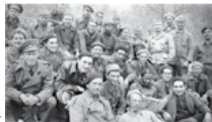
Abraham Lincoln Brigade members