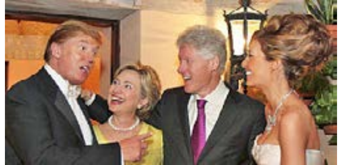
War Criminals of a Feather

Venezuela and standing with an illegitimate president is so hypocritical, it goes beyond the definition.