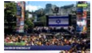
Venezuela's opposition cheer the U.S. and Israeli flags at their rally earlier today. pic.twitter.com/SXxzYyDMvs-teleSUR English (@telesurenglish) Feb. 2, 2019

As for the legitimate government of Venezuela, we all should proudly stand with President Maduro, and the people of Venezuela, who, after being empowered by the Bolivarian Revolution will refuse to descend back into poverty and tyranny. We cannot be like the fake lefties above who pretend to oppose intervention, while listing very good reasons for intervention, only if they were true.