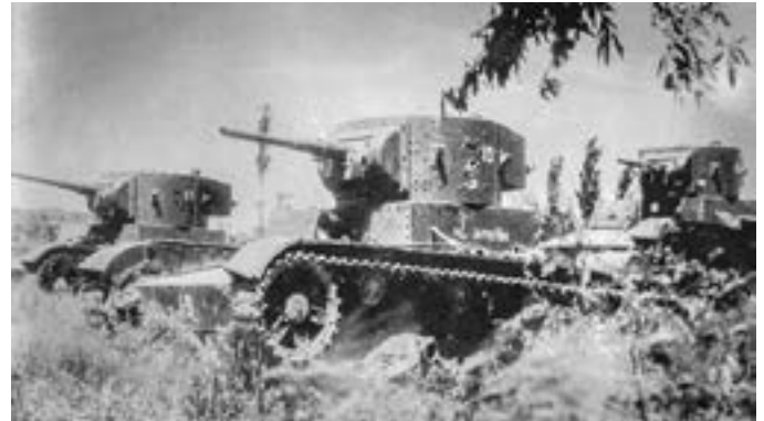
Soviet T-26 Tanks in Spain

Soviet government has saved the government in Madrid which everyone expected to collapse,” concluded the undersecretary of state at the foreign office. “The Soviet intervention has indeed completely changed the situation.” (p. 352)