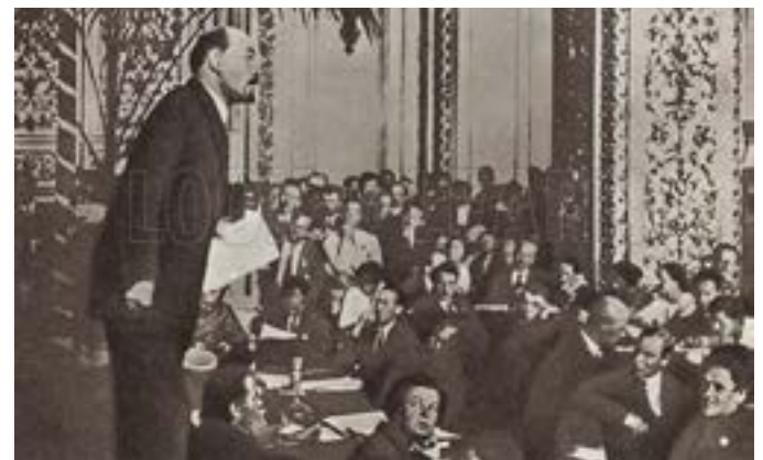
Lenin speaking at 3rd Congress of Communist International

“From the standpoint of preserving the Republic of Soviets itself:’ In the midst of the Civil War and Imperialist Intervention (1918-1921) the Communist International was established on the soil of the Soviet land under attack from all sides, and under the leadership of the Bolshevik-led government that was the main target of the attack! What Leninist boldness and vision! As the authoritative History of the CPSU(B) points out, “The Red Army was victorious because the Soviet Republic was not alone in its struggle against Whiteguard counter-revolution and foreign intervention, because the struggle of the Soviet government and its successes enlisted the sympathy and support of the proletarians of the whole world. While the imperialists were trying to stifle the Soviet Republic by intervention and blockade, the workers of the imperialist countries sided with the Soviets and helped them. Their struggle against the capitalists of the countries hostile to the Soviet Republic helped in the end to force the imperialists to call off the interventions.” (“October Revolution and the Communist International,” ibid. )