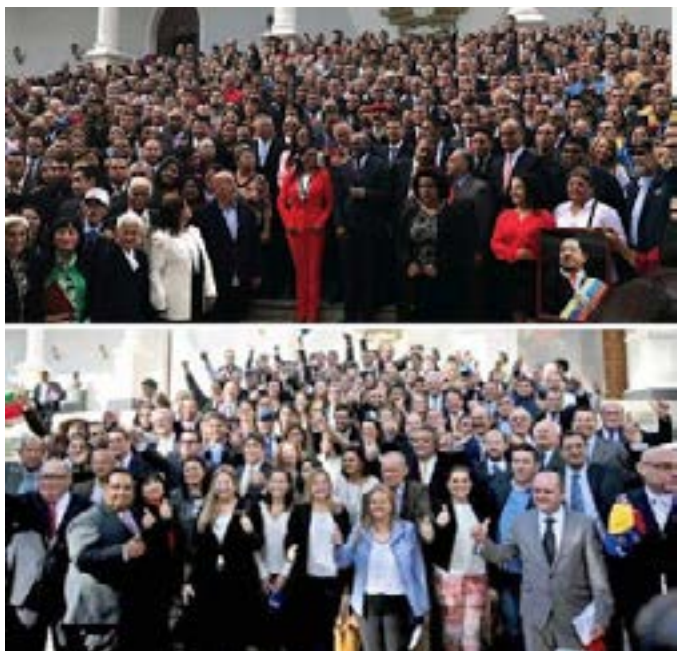
Top: Chavista Constituent Assembly. Bottom: political party of Guaidó.

We should strongly condemn the USA's recent attempts at further destabilization in Venezuela when the corrupt and vicious Trump regime “recognized” the traitorous, counter-revolutionary, Guaidó, as the legitimate leader of Venezuela by executive decree. By international law, the USA is the largest “state sponsor of terror” and the Trump regime has little support in the USA, so why should its decrees be accepted internationally?