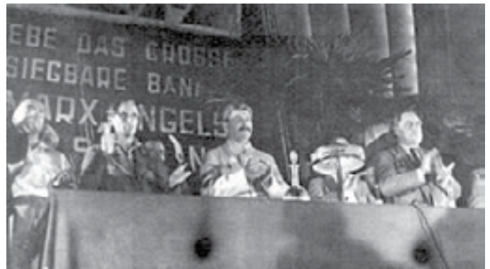
Stalin and Dimitrov at 7th Congress

After the trial, Dimitrov and his two Bulgarian co-defendants were quickly whisked out of Germany. The Nazis clearly could not handle him. With his unprecedented and invaluable experience in dealing with the Nazi Regime, Dimitrov was brought into the top leadership of the Comintern. At the Comintern's Seventh Congress in 1935 he presented the Main Report emphasizing and broadening the communist "anti-fascist united front" work as a corrective to the more aggressive but somewhat sectarian "class against class" orientation that had been projected since the Sixth Comintern Congress in 1928.