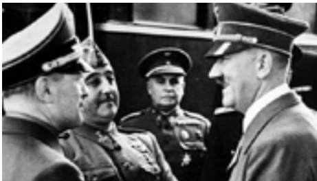
From right: Hitler, Franco Mussolini

To his credit, Kotkin exposes the connection between the brutality first meted out by Spanish General Francisco Franco and his brutal legions in