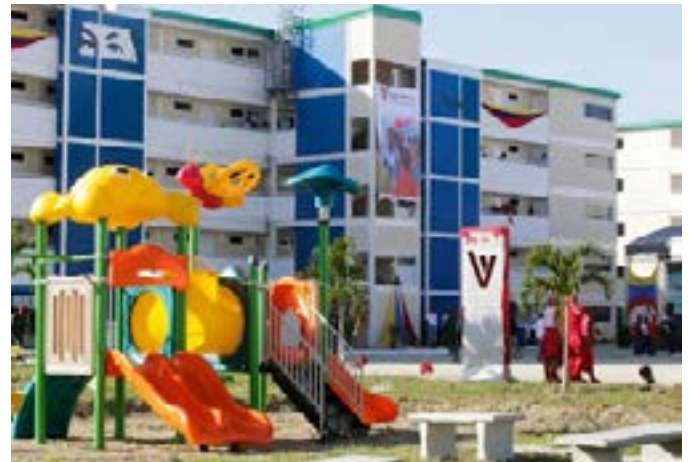
Some of the nearly 3 million low-income housing units built in Venezuela

totally responsible for the “failed economic policy” the authors lament in the second paragraph. Of course, that sentence is an attack on socialism and the very fact that even in the crisis, the people of Venezuela are housed and they are fed — unlike the gross policies of the imperialistic government that Khanna and Jayapal represent. Here, in the wealthy U.S. about one million children go to bed hungry every night and the Trump regime and its “left cover” dare to criticize Venezuela?