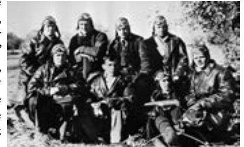
Soviet Pilots, Soto Airfield near Madrid

allowed to join, although many volunteered to.” Kotkin adds, “Already by early fall, there would be more than 550 Soviet personnel in-country.” (ibid, p. 338-339)